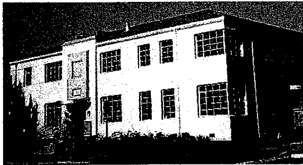
1938 Hamlin Medical Building 600 B Street

When you think of your neighbors, does it occur to you that they aren't all residential? With our historic district's location so close to downtown, many of our neighbors are commercial. One of these is the Service Employees International Union (SEIU) located in the old Hamlin Medical building at 600 B Street. This Art Deco building was constructed in 1938 and, together with the adjacent Thurlow Medical Building at 576 B Street and the downtown Rosenberg Department Store (now Barnes & Noble), is among the few examples of this important architectural style in Santa Rosa. The Exposition des Arts Decoratifs, held in Paris in 1925, supplied the impetus for the Art Deco style which emphasized modernity and a rectilinear pattern of exterior ornamentation. At over 65 years old, this building needed major updating to be a viable office space for a 21st century company. While other businesses might have succumbed to the temptation to modernize the outside of the building, ignoring its significance to Santa Rosa's history, the SEIU performed an impressive and sensitive remodel (both inside and out) that preserved the building's original style. The result is a modernized commercial building that contributes to our historic district rather than detracting or clashing with it. Congratulations on a job well done!