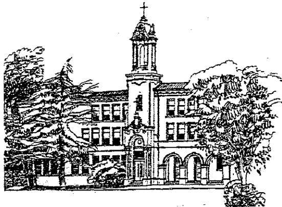
The St. Rose Neighborhood is a unique cross section of historic homes dating from 1872 to the 1940's.

We are delighted to already have over 20 households who have expressed interest in being a part of our new association. Since forming, other concerns have arisen from members such as: the amount of on-street parking, people camping in cars, abandoned cars, and drug dealing around the Homeless Services Center. (See the information further on in this newsletter about our scheduled meeting with the SRPD to start a Neighborhood Watch program to address these concerns.)